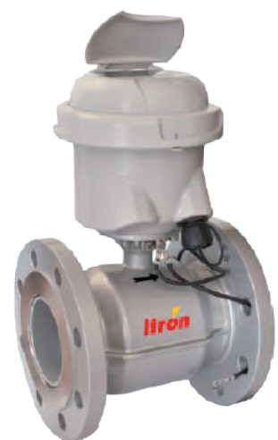
Electromagnet Flow Meter