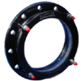
Dedicated Flange Adaptors