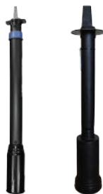
Extension Spindle (Rigid / Telescopic)

Deal with some of the best names in the industry to provide best in class service and expand our offering in water, wastewater, construction petrochemical and Oil & Gas.