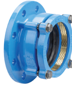
Ranger Flange Adaptor