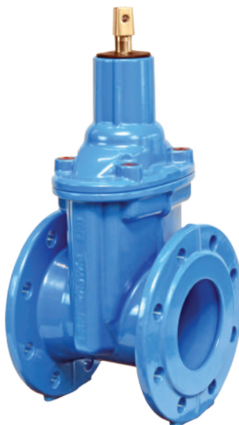
Restraint multi-range connection for all kinds of pipes