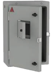
Water Meter Box