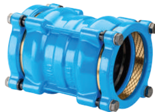
Ranger Stepped Coupling