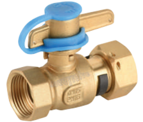
Lockable Valve (Antitheft)