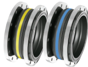
Rubber Expansion Joints