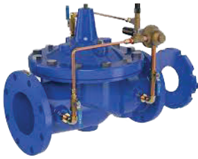
Automatic Control Valves