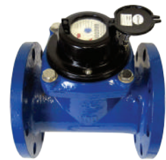
Mechanical Water Flow Meter